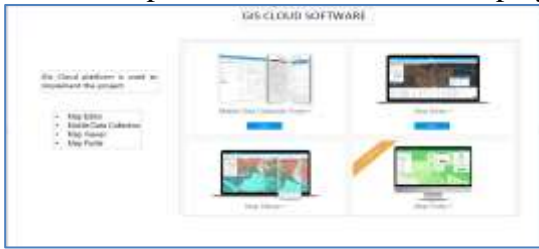
Fig. 3 Gis Cloud Software

Below, we present some results of the project implementation in Gis Cloud software.