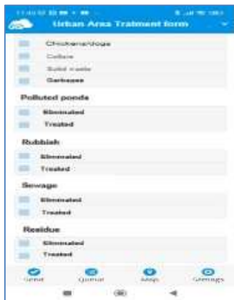
Fig. 5 Partial view of the module: Data Mobile Collection (authors)

The mobile data collection module is used. Implemented forms in accordance with the requirements set by the contractor are used to collect detailed information.