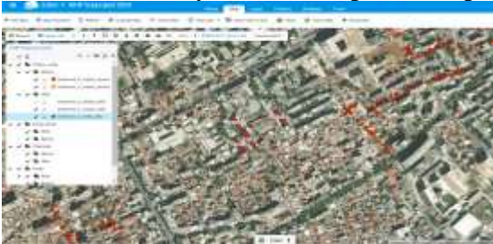
Fig. 4 Editor Map, Gis Cloud

Are designed 4 layers groups: Lagunes_Parks, Urban Zone, Cellars_Wells, and Canals_Pond with a lot of the relevant layers. The scripts are implemented over 210 layers.